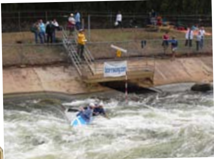
The US Canoe/Kayak Slalom National Championships at Mirant's Dickerson Station Sept. 26, 2010

Includes the chef demo, lunch & a swag bag. Classes begin at 11:30 a.m. Space is limited, so register early. Call 301.881.4793 to register.