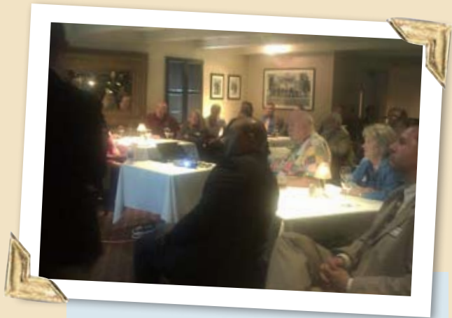
US Open Event on September 22

This event was held at and sponsored by: Timpano Chophouse • 12021 Rockville Pike • Rockville, MD 20852