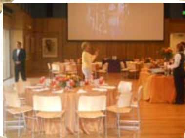
Foyer at Silver Spring Civic Center